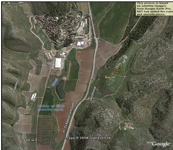
Aerial view of the Valley of Elah

One of the major Roman roads from Jerusalem to the coast passed through the Elah valley, following the path of the Biblical way. The Roman road on this section is part of the ancient road from Ashkelon, a large Roman port city on the coast, to Bethlehem and Jerusalem.