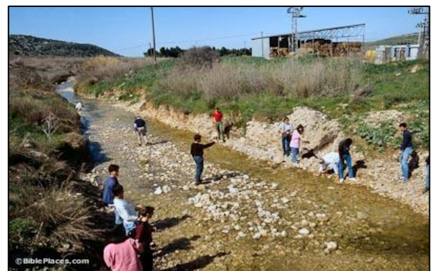
Brook Elah is famous for the five stones of David's sling