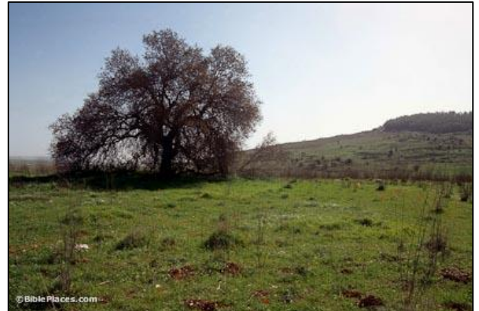
Elah Terebinth or oak

David's battle with Goliath is a great explanation of God's plan of salvation, working through a faithful man to deliver both him and his people.