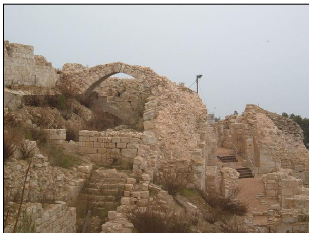
Crusader ruins in Safed

and metaphysical principles in the Scriptures to explain the nature of the universe, existence and various ontological questions; they claim knowledge comes from meditation not necessarily by reading the Torah.