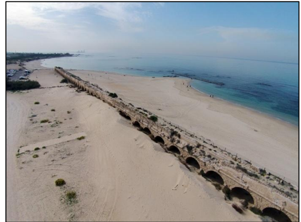
The famous aqueduct at Caesarea

The city had a mixed population that was half Jewish and half Gentile, which was often a cause of controversy. The great revolt of AD 66-70 actually started in Caesarea due to a dispute over a pagan ceremony held outside a synagogue on the Sabbath. When the Roman's ignored the Jewish protests the violence spread across the country. When the Romans finally ended the rebellion Caesarea became the capital of Palestine.